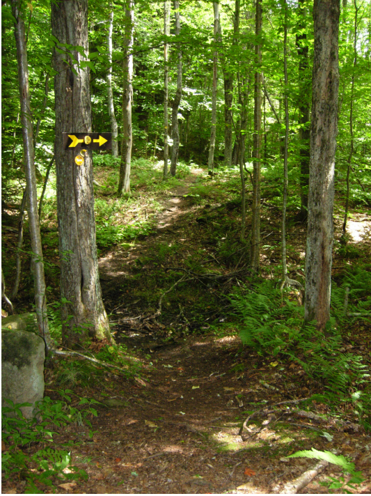
Junction with the Connector Trail and the proposed Cranberry 50 East Connector Trail.