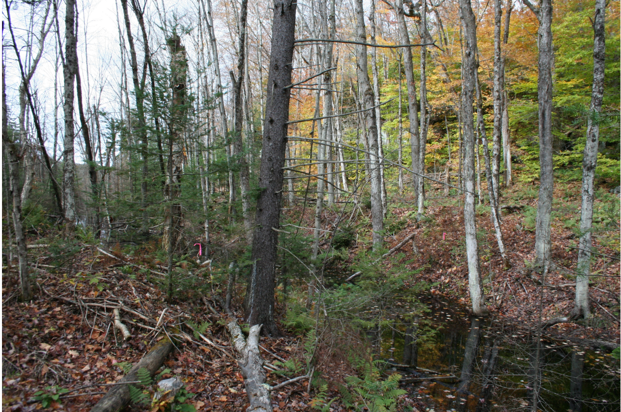
Proposed Foot Bridge Crossing Site – CL 50 Western Connector Trail