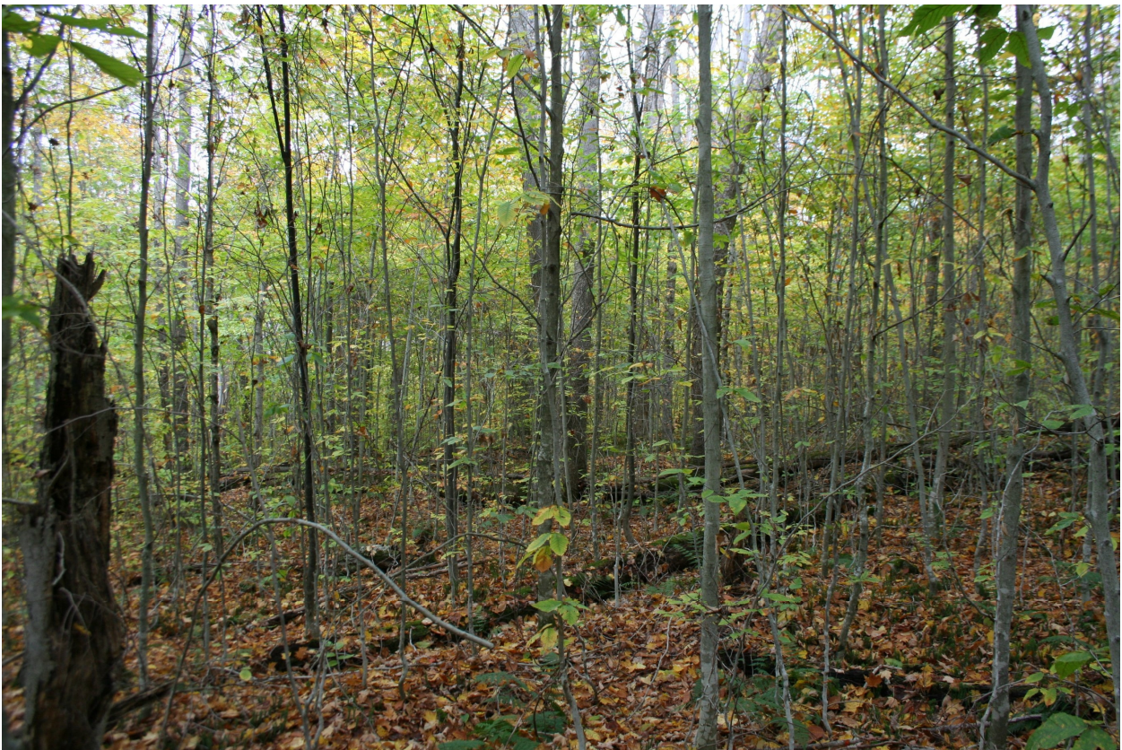
Peavine Swamp Ski Trail – Loop #1