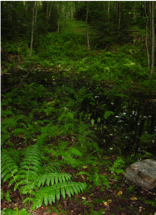
Wet section of proposed Cranberry 50 East Connector Trail.