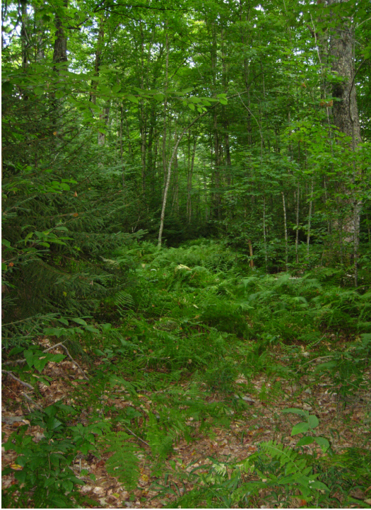
Typical character of proposed Cranberry 50 East Connector Trail.